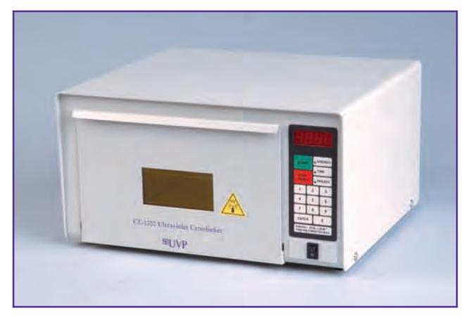
CL-1000 Crosslinker is an exposure instrument which uses shortwave UV energy to bond the DNA to a medium.

UVP Crosslinkers assure consistent UV output for many applications including DNA bonding and UV curing. UV crosslinking for attaching nucleic acids to a membrane for example, takes seconds as compared to oven baking. The crosslinkers utilize a microprocessor to control and measure the dose of UV radiation.